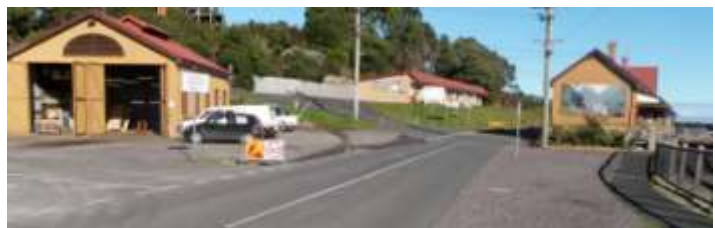
Figure 18 Restored Loco Shed and rejuvenated Station on the right c2005 (Cooper)